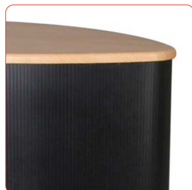
Plastic tambour wrap is available in black, white or covered with Prelude fabric