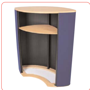
Internal shelf included, unit is open at the back