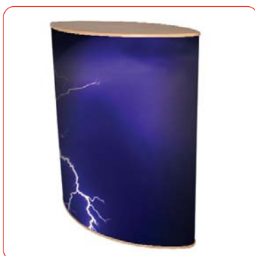
Laminate graphics can be applied to the tambour wrap or directly printed